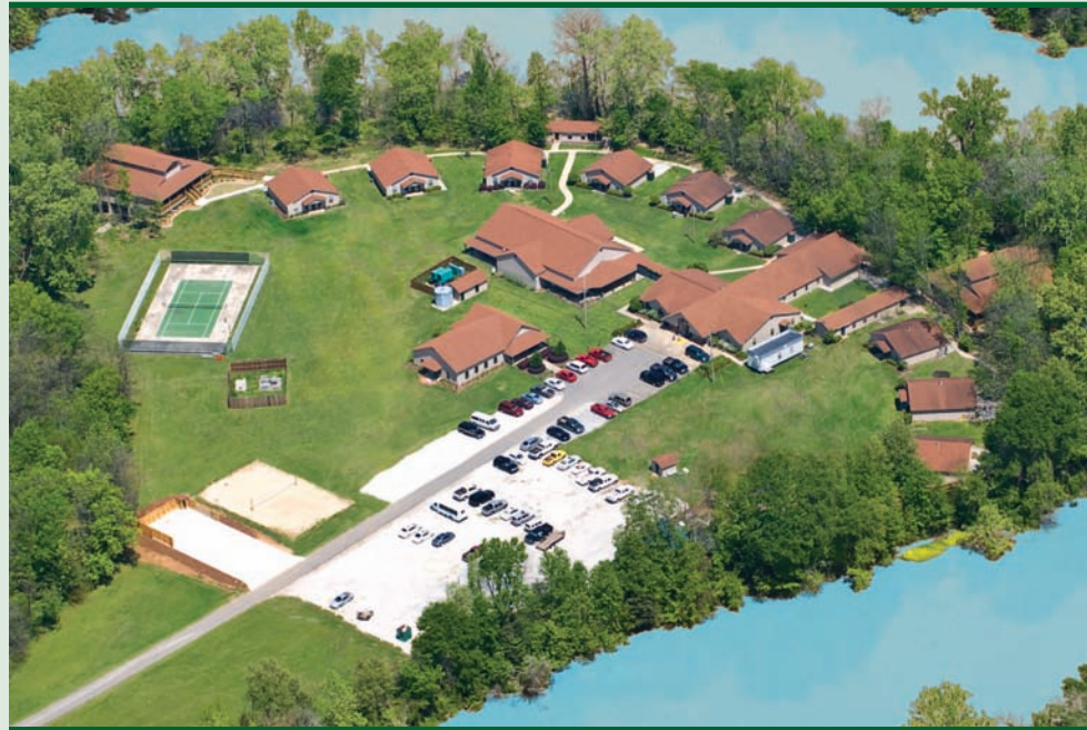
Our 70-acre campus is almost completely enclosed by the beautiful Lake Lafourche.

Founded in 1993, Palmetto Addiction Recovery Center has been effectively treating patients for over a decade. We are a 92-bed residential treatment facility that provides 5-day evaluations, residential, and intensive outpatient treatment programs.